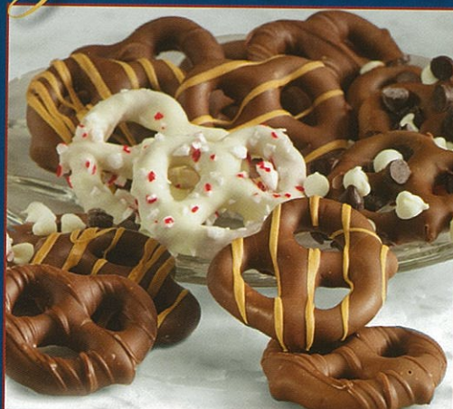
PRETZEL DELIGHTS Chocolate Covered Pretzels

Pastallios de Chocolate y Pastallios de Chocolate con Mantequilla de Cacahuete