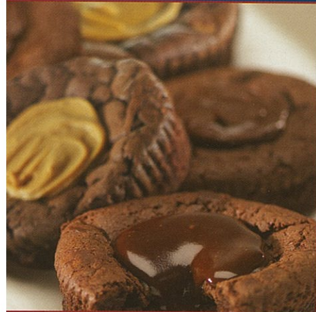
DELICIOUS™ Chocolate Fudge & Peanut Butter Cakes

The rich center melts when microwaved for the true chocolate and peanut butter connoisseur. Restaurant quality, home convenience! No preservatives or fillers added. Packed in resealable containers with 5 individually wrapped fudge cakes.